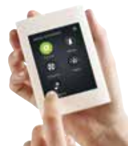
Enervent eAir + web interface

Enervent Svea is equipped with connection for a cooker hood that also goes through the additional module. The extract air from the cooker hood is led past the heat exchanger in the ventilation unit and the air flows directly to the unit's extract air fan. This prevents the heat exchanger from getting dirty and greasy.